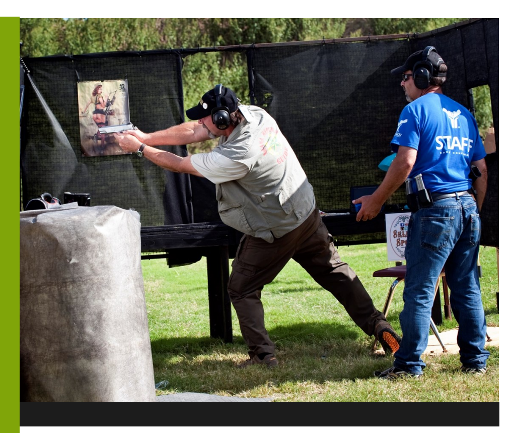
What you need to know prior to Competitive Shooting